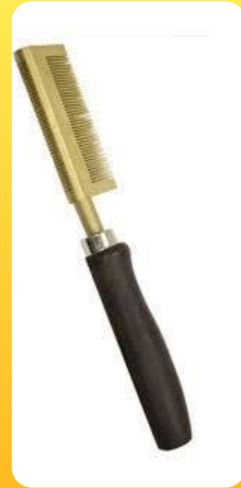
Hot Comb by Madam CJ Walker In 1906.