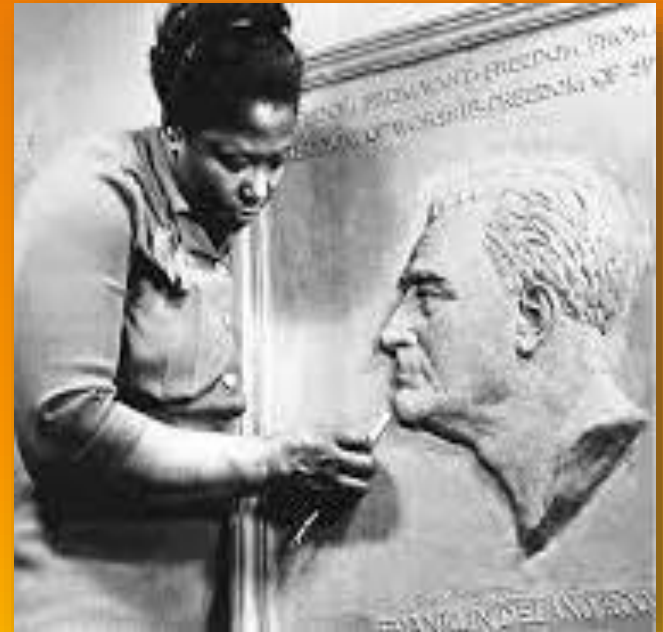
Selma Burke 1900-1995

First African American to receive a PhD in mathematics.