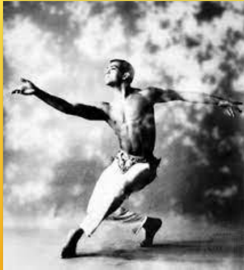
Alvin Ailey 1931-1989

World famous choreographer who founded the Alvin Ailey American Dance Theater in 1958.