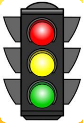
Modern traffic signal by Garrett Morgan in 1923.