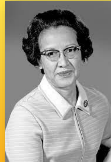
Katherine Johnson 1918-2020

World famous choreographer who founded the Alvin Ailey American Dance Theater in 1958.