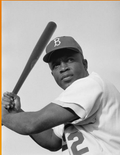
Jackie Robinson 1919-1972

First African American to play Major League Baseball.