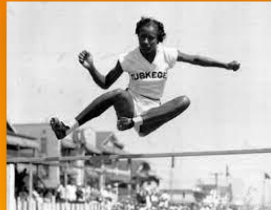
Alice Coachman 1923-2014

First African American to play Major League Baseball.