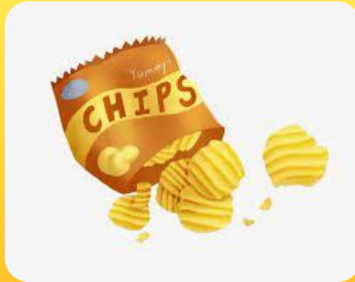
Potato chips by George Speck in 1853.